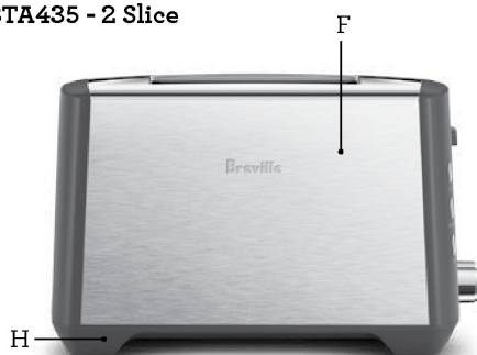
BTA435 - 2 Slice