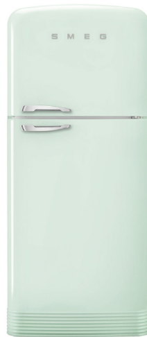
FAB50RPG5AU Pastel Green