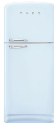
FAB50RPB5AU Pastel Blue