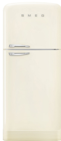
FAB50LCR5AU FAB50RCR5AU Cream