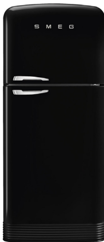
FAB50LBL5AU FAB50RBL5AU Black