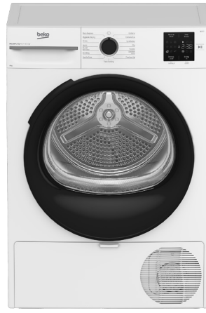
BDPB8010W 8kg Heat Pump