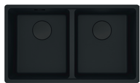
MRG620-35/35 MB NOTE: Matte black waste included