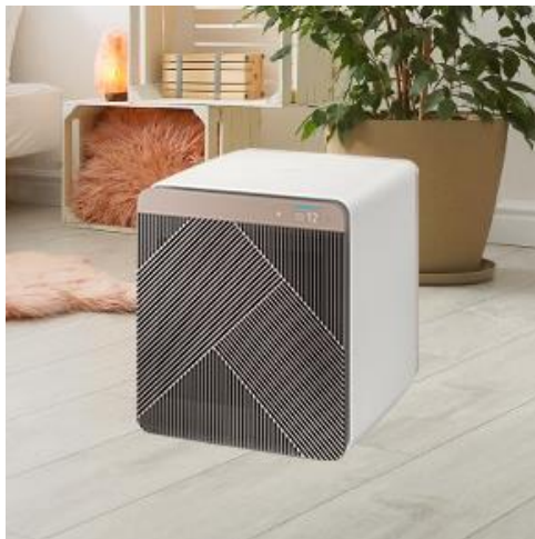
Bespoke Cube™ Air Purifier