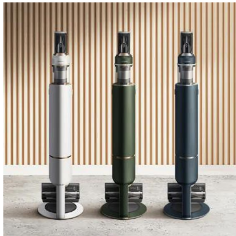
Bespoke Jet™ Vacuums